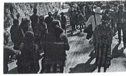
JULY 2019 O. PANDOLFI