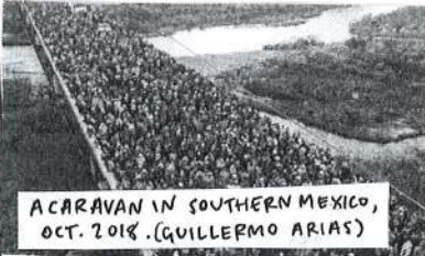
ACARAVAN IN SOUTHERN MEXICO, OCT. 2018.

THE US GOVERNMENT HAS ATTEMPTED TO DETER MIGRANTS WITH INHUMANE POLICIES AT ITS SOUTHERN BORDER: