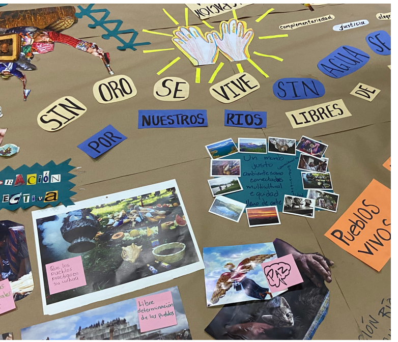
Collective Art - "What World's Do We Dream & Imagine?"

"Real power is not in governments, it's in the people! Yes, governments have all that power, but we have our ways. If we don't defend us all, they will exterminate everything. That's why we must keep organizing! According to the will of Indigenous peoples, everything is possible!" - Encuentro Participant, Elder, Maya Mam, Water Protector