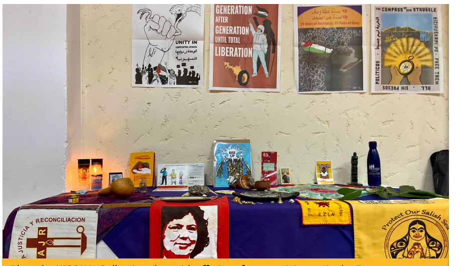
Collective altar with offerings from participants in the Encuentro.

In the midst of an intensifying political context, election season, and the immense fatigue of surviving multiple forms of state and capitalist violence, the Encuentro was also a sacred space to reconnect with our memories, our genealogies of struggle, and with old and new comrades.