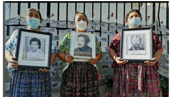
Family members of disappeared await a ruling in which a military commissioner was convicted.

We are so grateful to you for walking this path with us.