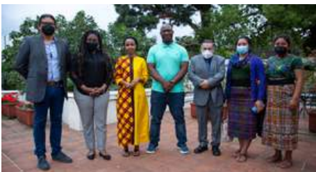
During their first day in Guatemala, the Congressional Delegation met with our J&A partners.