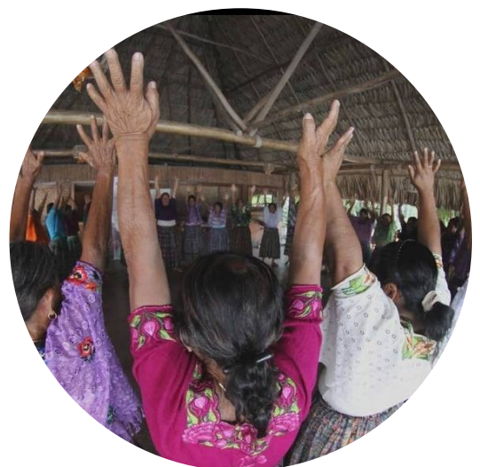
Sepur Zarco, Cahabón, Alta Verapaz. 2019.