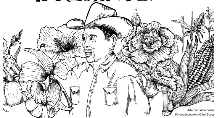
Illustration by: Isa Villalón (former NISGUA accompanier) Instagram: @HoopsLoopsAndOtherScoops