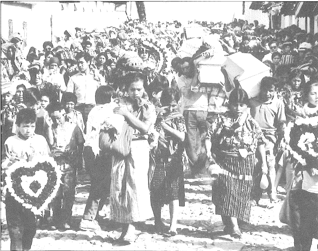
A funeral procession in Chichicastenango, Quiché province. The coffins contain the remains of 27 victims of an army massacre originally buried in a clandestine cemetery.