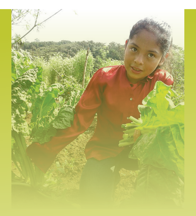
Less than 1% of all Guatemalans ever enroll in college and less than 50% of those that do ever graduate. We want to change this trend.